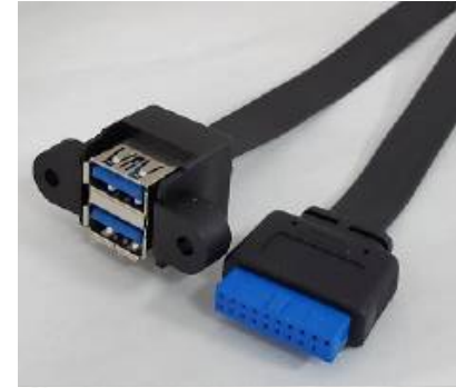
USB 3.0 A FEMALE DUAL PORT TO INT. USB 3.0 20 PIN CONN. FLAT CABLE